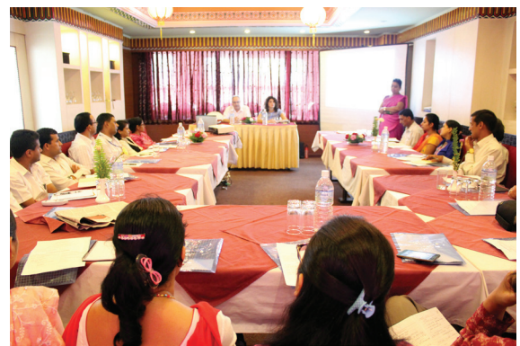
Participants at the GESI Training workshop at Kathmandu.

The NPTF organized a Gender Equality and Social Inclusion (GESI) sensitization workshop on 30 and 31 July in Kathmandu. Twenty-five officials of the MoPR and IAs attended the workshop. The training was part of USAID's technical assistance for mainstreaming GESI concerns in programs and projects of the NPTF and MoPR.