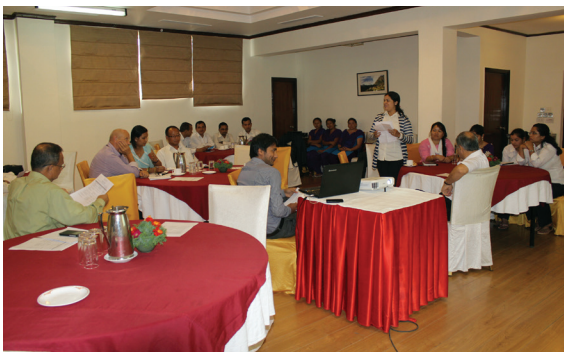
NPTF officials and EUTA team at an Induction programme for new staff.