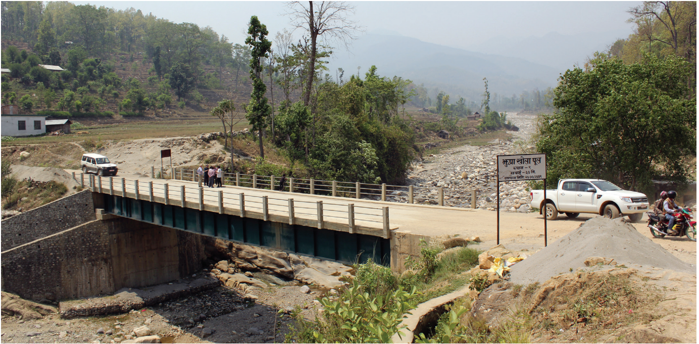
Vehicles on the newly constructed Jhupra Bridge in Surkhet and an NPTF monitoring team observing the construction.

main and 21 satellite cantonment sites. The project was implemented through 10 Divisional Road Offices (in Damak, Ilam, Biratnagar, Lahan, Janakpur, Bharatpur, Butwal, Dang, Surkhet and Mahendranagar).